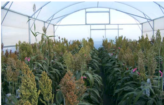
Figure 2: Hybrids growing inside the plastic igloo

A plastic igloo is used to provide ideal environmental conditions for both sorghum and midge. Standard lines (hybrids of known resistance rating) are grown alongside test hybrids in the trial. High midge pressures are applied during the flowering period and daily counts of midge numbers are performed during this time. Post seed-set all lines are assessed for head damage and a value of: % damage/total # midge present is derived for each plant in the trial.