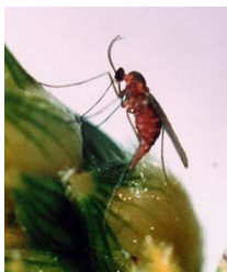
Figure 1: Female midge laying eggs in a sorghum floret

Sorghum midge ( Stenodiplosis sorghicola ) is an important economic insect pest of grain sorghum in this country. Midge Resistance (MR) was first introduced in Australia around 20 years ago and now all sorghum hybrids on the market contain some level of midge resistance. DEEDI, with funding from GRDC and three major commercial sorghum breeding companies (Pacific Seeds, Pioneer Hi-Bred and HSR Seeds), runs the independent testing scheme which determines the midge resistance ratings for all new sorghum hybrids prior to their commercial release.